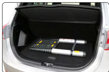
easy transport, storage and carrying